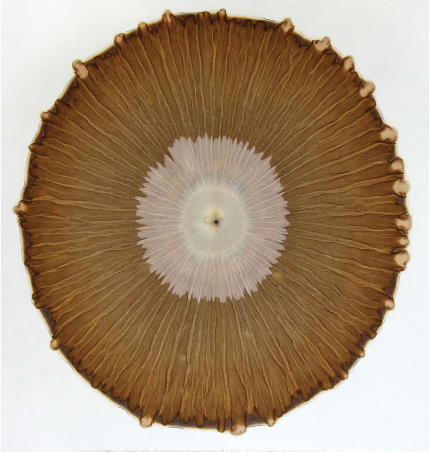
#26 14 JA 16 | BHW-8 | 5 10cm | 1.925g /50 mi NaOH 1% blended samples 03 vir & 13.x | 14.x.16 | AgNO3 5% ETOH 50% | 24.x.16 | h

Soil Portrait #26, Debra Solomon, 2016-ongoing. Soil chromatography, soil building, 580 × 580 mm. Soil Portrait #26 (SP#26) is a soil chromatogram sampled from the self-made topsoil produced in situ by Solomon, Urbaniahoeve, and in close collaboration with the nonhuman soil-building community of the Urbaniahoeve Food Forest Ecosystem in Amsterdam Noord. SP#26 depicts a young, well-aerated soil, comprised of a high percentage of partially decomposed organic materials. This illustrates that organic material, even when not completely decomposed, is accessible to many species of soil life present in this highly composed, urban technosol ecosystem.